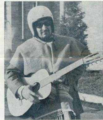
This mystery celebrity will be attending all of this year's reunions. Return for the reunions and identify him.

Any questions or problems, feel free to contact the Campion Alumni office.