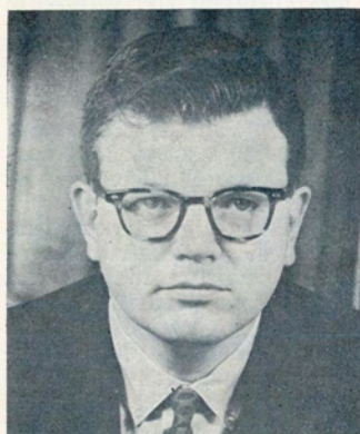
Garry L. Wills '51