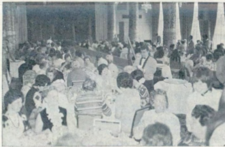
Spring Fashion Review