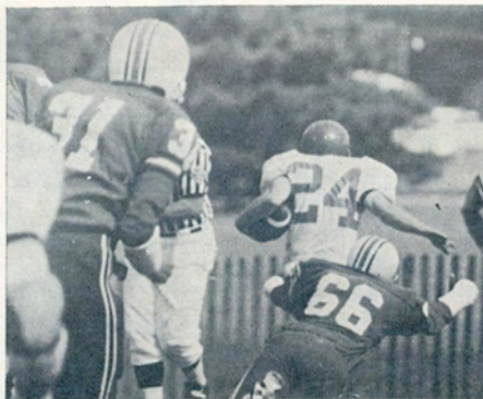
Campion defense closes in on St. Thomas ball carrier.